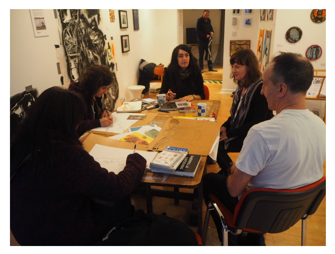
Hope Gardens community art workshop at W3 gallery

The public art will be created in the New Year. Check www.artification.org.uk for updates.